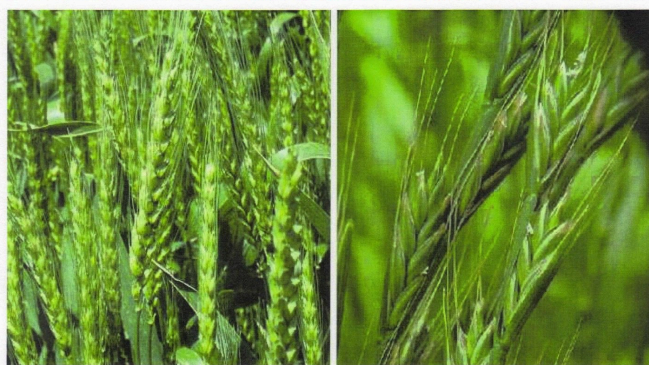
WHEAT: before it is fully ripe.